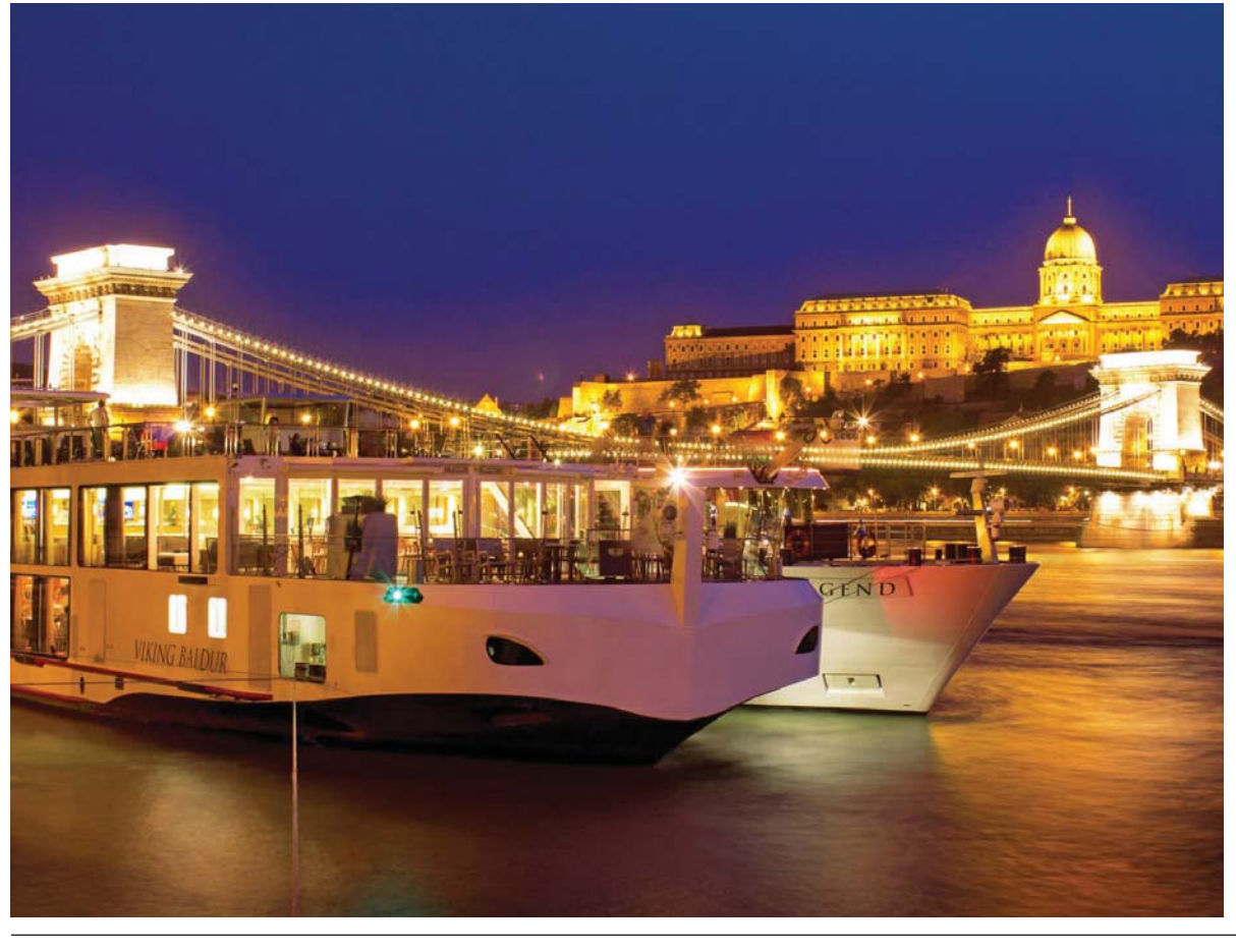
Budapest panorama, which is part of the world heritage, with Gellért Hill in background

Budapest is a key destination among European river cruises. With the unique coast of the Danube, world heritage sites on both Pest and Buda side and rich historical and cultural offers, the capital deserves its special place among European river shore cities. The most beautiful view of the city