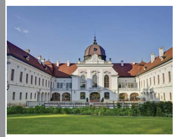
The Royal Palace of Gödöllő is an imperial and royal Hungarian palace located in central Hungary.

greets passengers arriving on the Danube. The first landmarks they see are the Buda Castle, the bridges over the Danube, and the view of the Danube embankments, which is a cultural world heritage site.