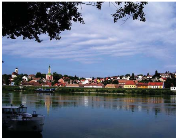
Szentendre is a small Hungarian town near the Danube bend, framed in a picturesque, natural setting with the winding river, nearby hills and mountains.

Budapest, visits to Gödöllő Castle Museum (Buda Castle) and the small, romantic, picturesque, Szentendre, are highly desired.