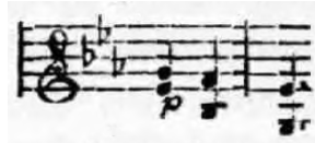
FIGURE 1. Op. 81a, first movement, right hand, m. 1 and first part of m. 2

An occasional work, but such as an ingenious master creates! The farewell begins with an Adagio, whose simple principal idea: