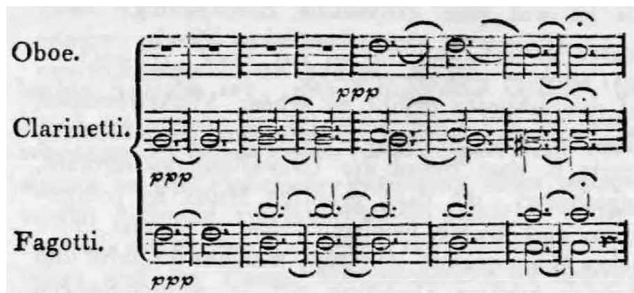
FIGURE 5. Op. 84, overture, reduction of mm. 279–86. This should be read with treble clefs in the oboes and clarinets, bass clef in the bassoons, and a key signature of four flats, which is modified to two flats in the clarinet part since the instruments transpose to B-flat.

At the conclusion of the Allegro this theme enters once again in the principal key of F minor, and the music dies out in sustained ppp chords in the oboe, clarinet, and bassoon.