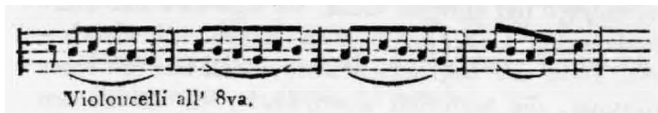
FIGURE 3. Op. 84, overture, mm. 25–28, clefless version of the first violin and cello parts, which are in different octaves. The key signature is four flats.

The composer sustains the same clarity with which he began throughout the entire overture, while the two themes of the Sostenuto often return and weave themselves into the Allegro. With-