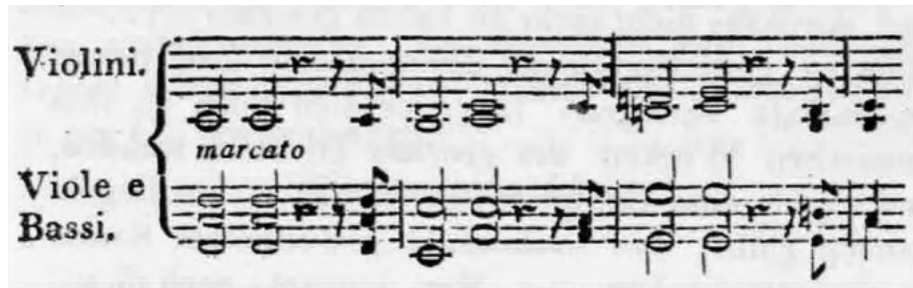
FIGURE 2. Op. 84, overture, reduction of mm. 2–5, beat 1. This should be read with treble and bass clefs and a key signature of four flats.

Already in the fifteenth measure, the theme of the following Allegro enters in D-flat major, which is then begun twenty-five measures later in 3/4 time by the first violin and violoncello: