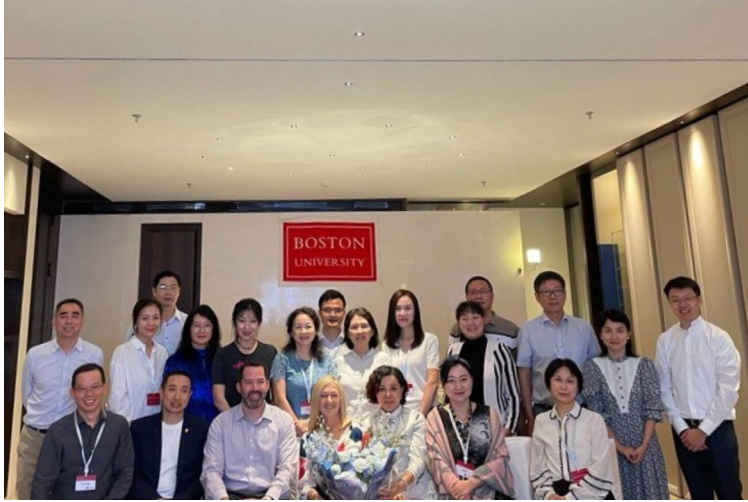
Global Parents Reception Event in Shenzhen, China