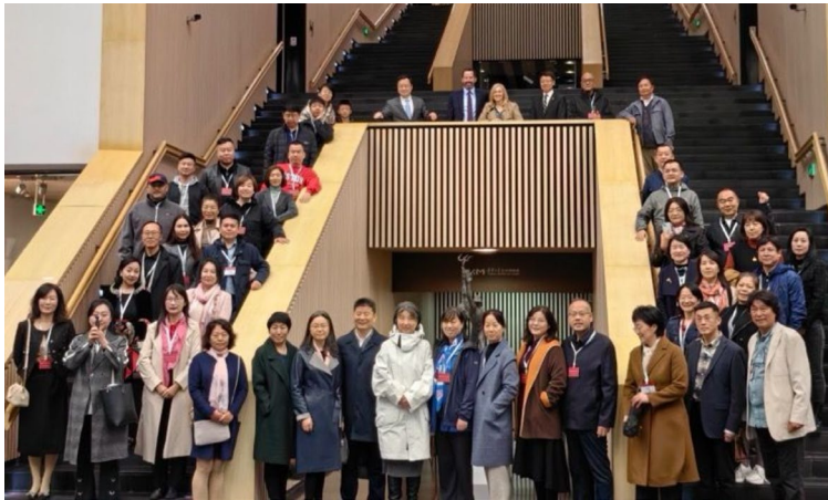
Global Parents Reception in Beijing, China