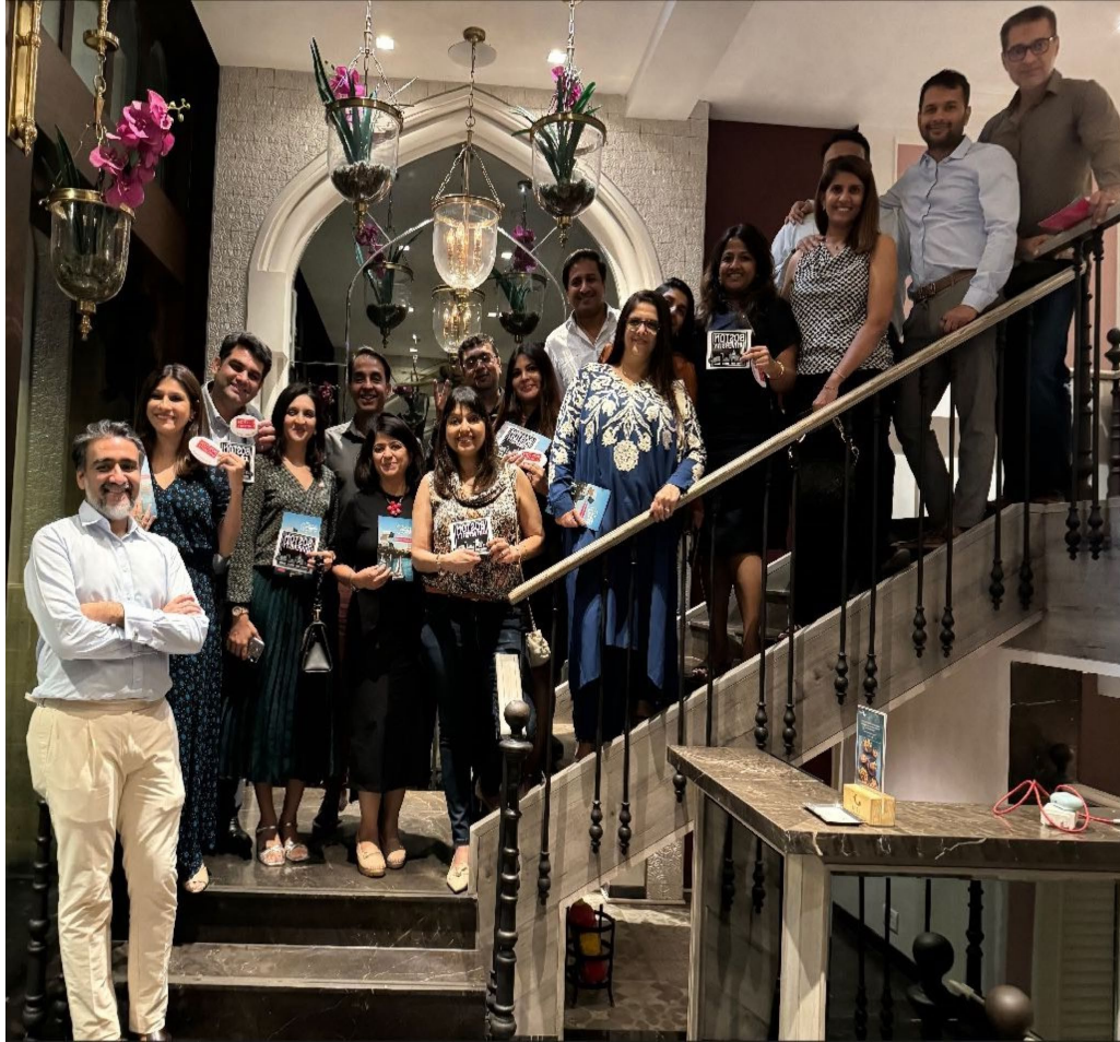
Global Parents Reception in Mumbai, India