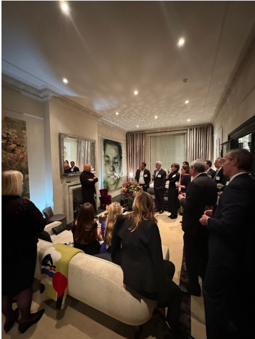
Global Parents Network Event in London, UK