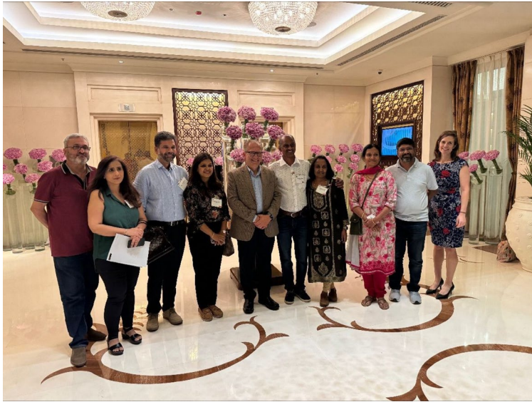
Global Parents Reception in Bangalore, India