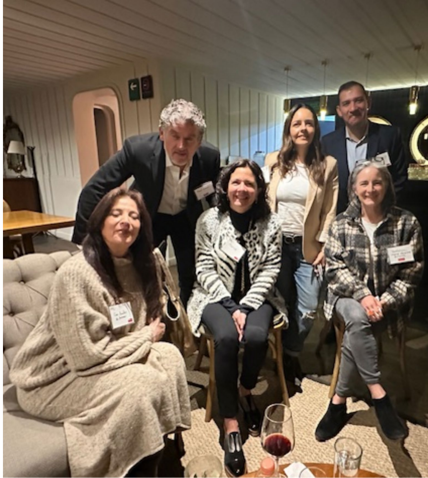
Global Parents Reception in Mexico City, Mexico