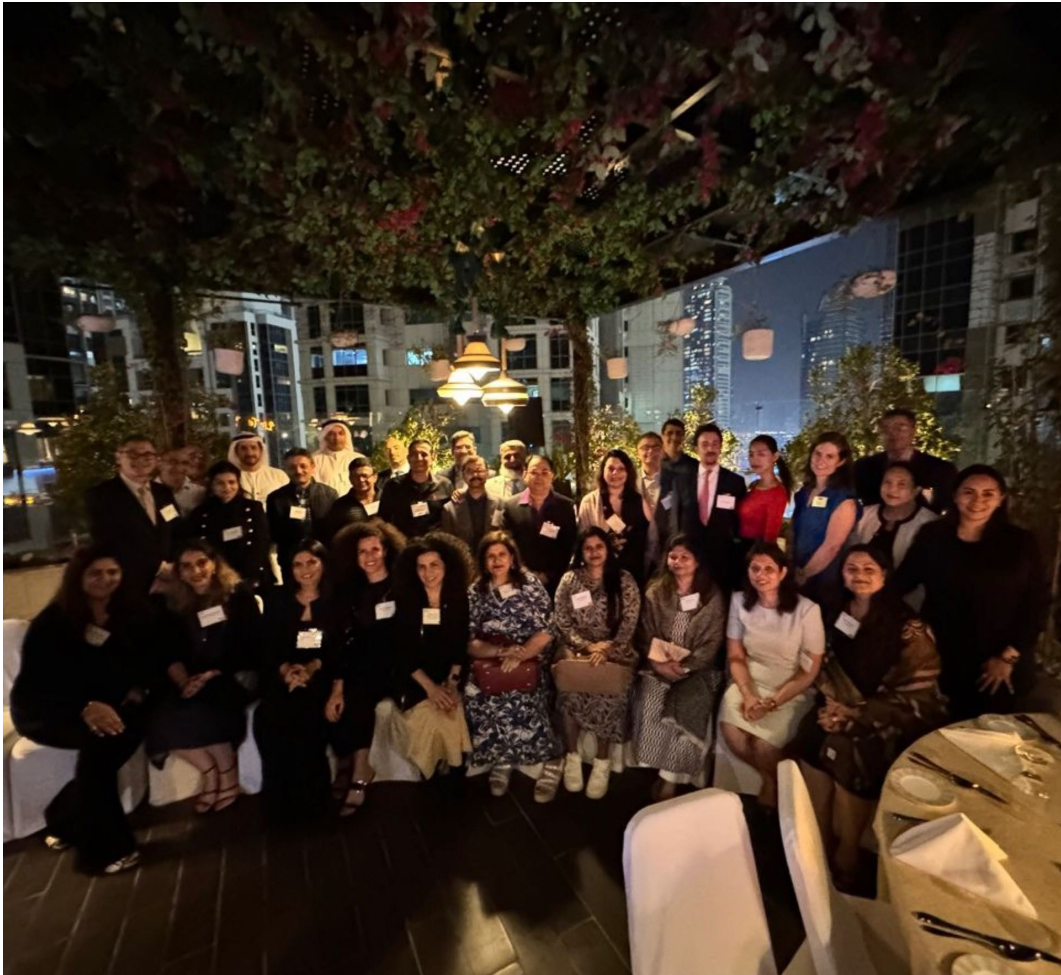
Global Parents Reception Event in Dubai, UAE