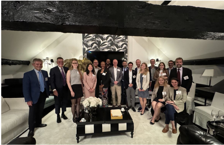
Global Parents Reception in Geneva, Switzerland