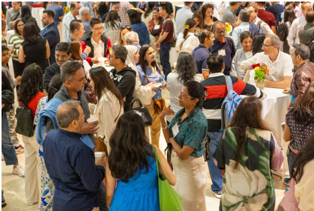
Parents at the First Annual Global Parents Reception