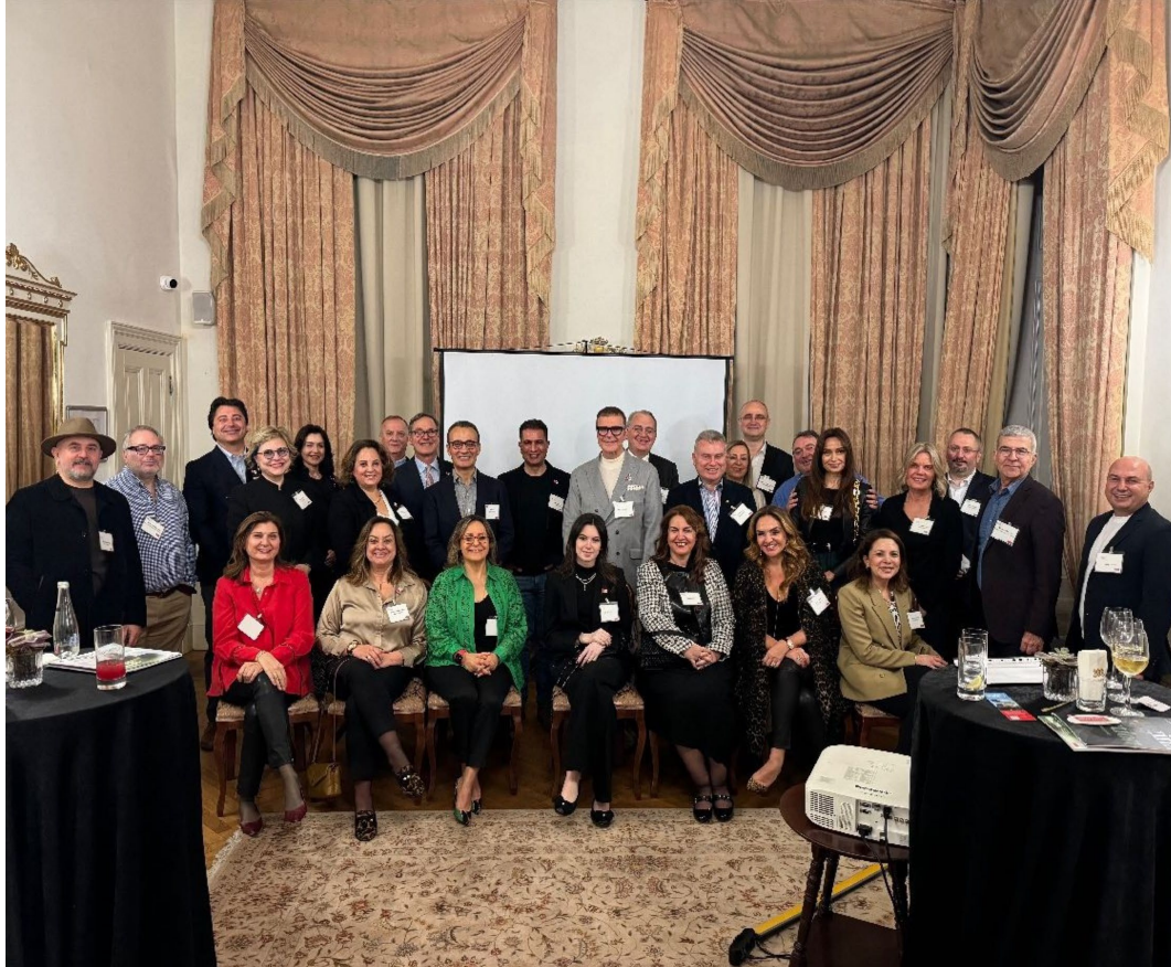
Global Parents Network Event in Istanbul, Turkey