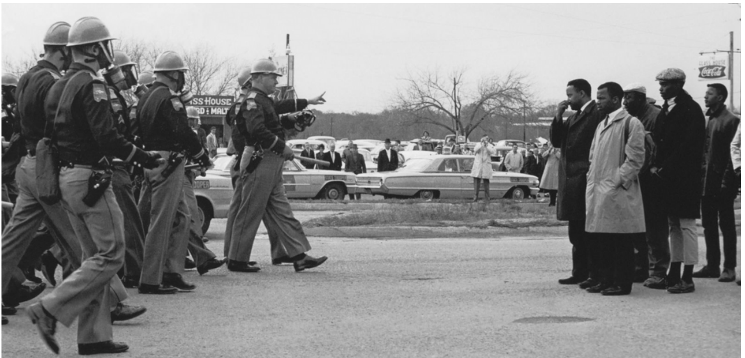
Lewis, Williams and other marchers face a line of state troopers blocking the Edmund Pettus Bridge.