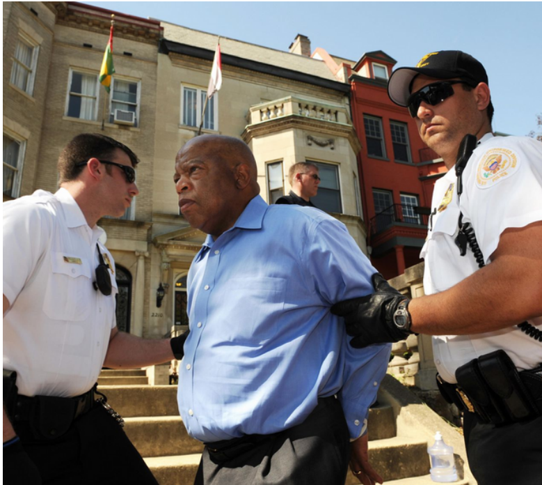
Lewis is led away in handcuffs by a Secret Service officer in Washington, DC, as he protested Sudan's Darfur conflict in April 2009.

BU Today: US Rep. John Lewis to 2018 Grads: Be Bold and Courageous