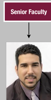
Early-Career and Under-Represented Faculty

“Mutual Mentoring encourages early career and under-represented faculty to build a network of support consisting of a variety of mentoring partners.”