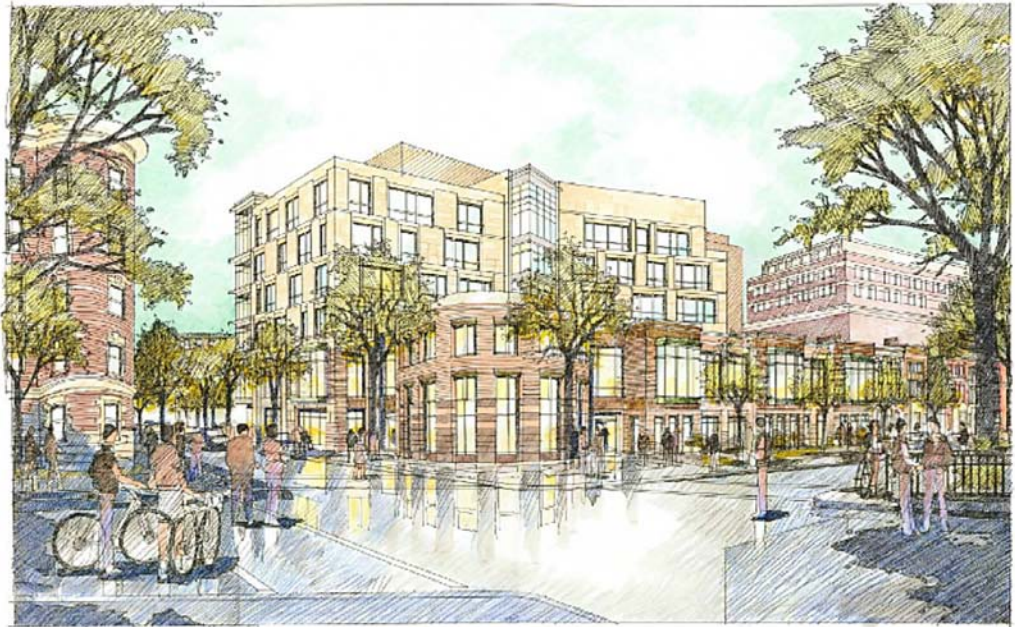
Architectural drawing of new 100,000-square-foot Student Service Center.

A recent University-wide task force on undergraduate education led by the Associate Provost for Undergraduate Education has filed its report ( One BU: Unlocking the Undergraduate Experience , at www.bu.edu/unlock ) and proposed several initiatives that will expand opportunities for students and strengthen programs. Creating consensus around these initiatives and implementing the recommendations of this report will be a major responsibility of the University Provost. Significant progress toward consensus has been made and resources are being allocated. A new Student Service Center that will house expanded and integrated services for undergraduates has been approved for construction, which is being funded with internally generated reserves.