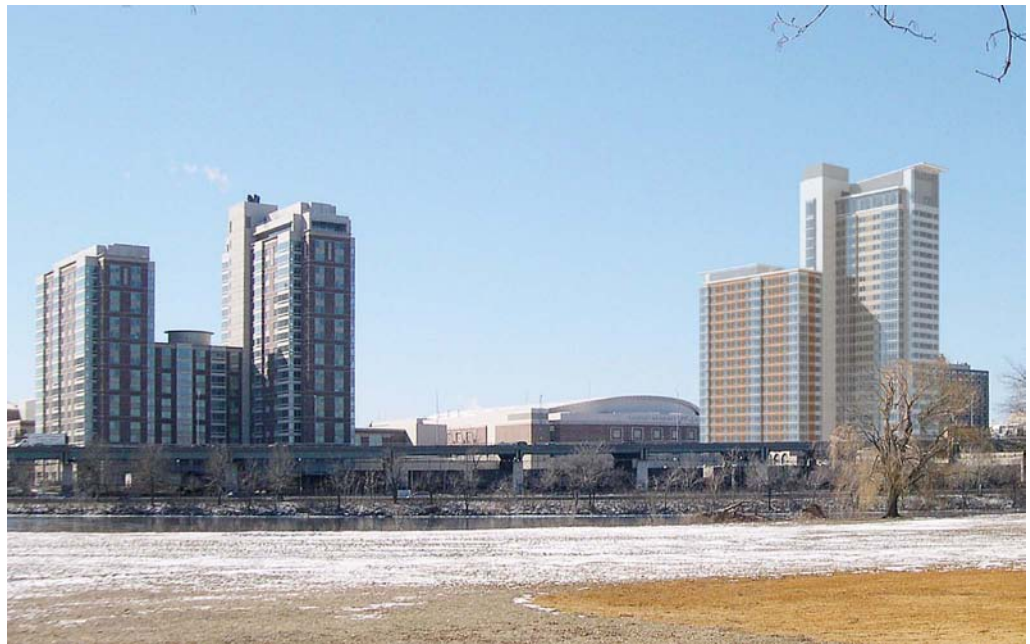
John Hancock Student Village viewed from across the Charles River.

From its founding, Boston University opened its doors to women and minorities. However, the University's ascent into the ranks of major private research universities is recent. Founded in 1839 as a Methodist seminary, the University was incorporated in 1869 and emerged in the twentieth century as a Boston-area institution. Until the early 1970s, the University was mainly non-residential, with a modest research profile and limited on-campus housing. The transformation into today's Boston University began in the early 1970s with a conscious decision to raise the University's standing and quality by marshaling resources, primarily from operating funds, to build an infrastructure for basic and applied research and to improve the campus by adding residential facilities. These now include state-of-the-art residential high-rises—developed in the past decade—that anchor the John Hancock Student Village and redefine Boston University's skyline.