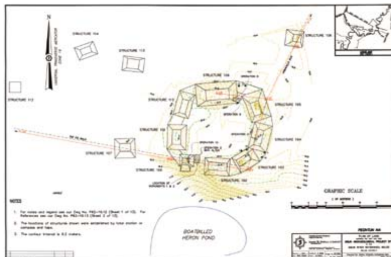
Detailed topographic map of Pechtun Ha showing locations of excavations