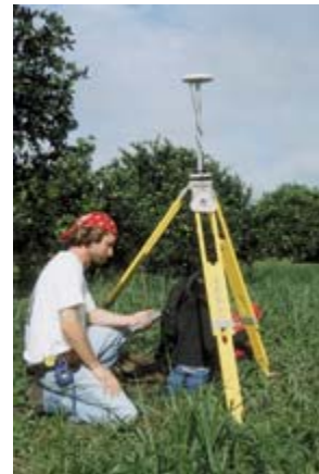
Sokkia GPS system operated by staff member, Sean Downey.

Actun Ik (“windy cave”) is the focal point of the second cave district. Known locally as “The Thumb,” it is a prominent piece of tower karst that dwarves the surrounding hills. Acquiring GPS coordinates from the lofty top of The Thumb was no problem, although mapping teams inside the cave were plagued by an aggressive, biting insect called a blood-sucking cone-nose beetle. In the twilight zone of Actun Ik, students discovered that the cave walls had once been painted in red and black with abstract designs and handprints.