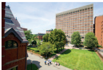
A $12.5 million anonymous gift has created the Center for Innovation in Social Work and Health, which will be sited on BU's Medical Campus.

An SSW fact sheet about the new center says collaboration will promote more efficient and