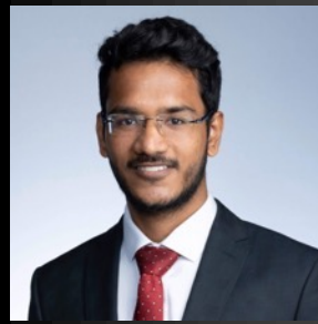
PURUSHOTTAM INDUSTRIAL ENGINEERING