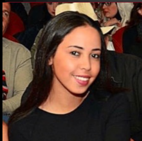
LINA POLITICAL SCIENCE