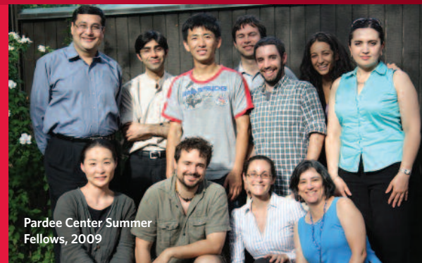
Pardee Center Summer Fellows, 2009

From the start, the Pardee Center has sought the company of inspiring minds.