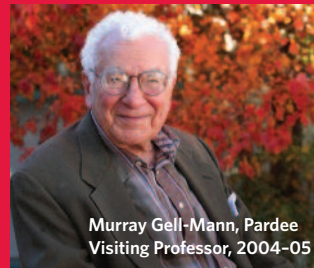
Murray Gell-Mann, Pardee Visiting Professor, 2004-05

From the start, the Pardee Center has sought the company of inspiring minds.