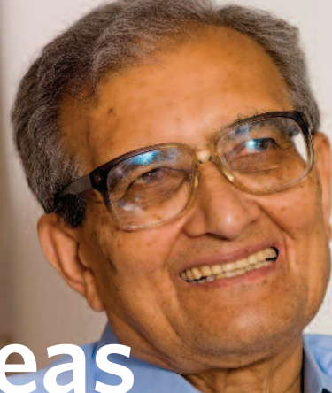
Amartya Sen, Pardee Visiting Professor 2001-02