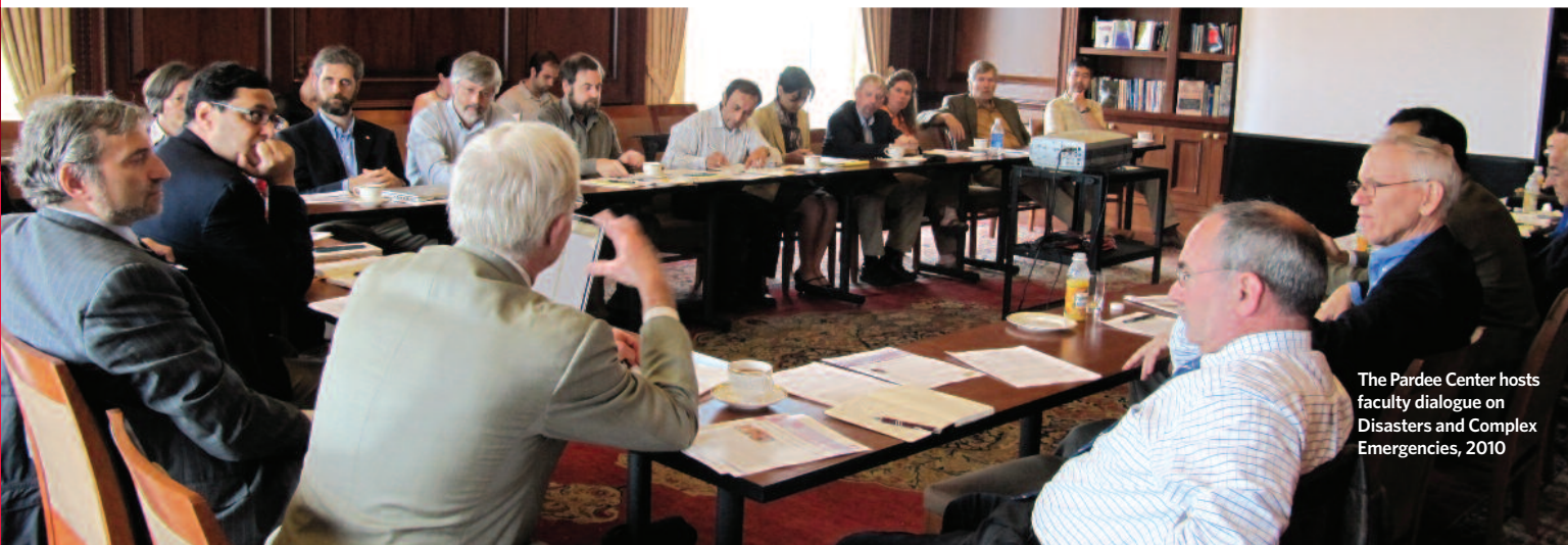
The Pardee Center hosts faculty dialogue on Disasters and Complex Emergencies, 2010