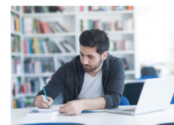
How to Use Writing Feedback