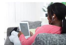
How to Use a Whiteboard