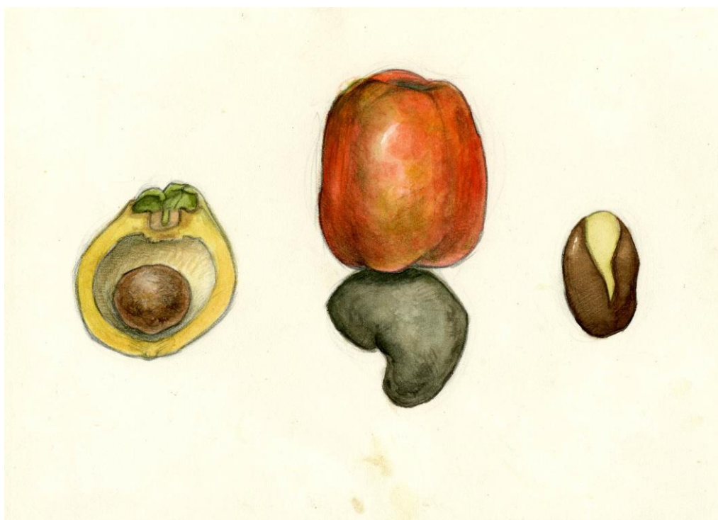
ILLUSTRATION BY NOEL BIELACZYC