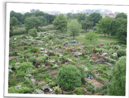
Fenway Victory Gardens in full glory

After an eventful FVG meeting, the Garden Club members set about retrieving salvaged wooden pallets (courtesy of Taza Chocolate) that will be re-appropriated as planting containers and repairing the fencing around the gate. Mulching, weeding, and planting cover crops late last fall made spring soil preparation a breeze. After a quick rake and a little weeding the plot was ready to go. Now comes the fun part! If you want to learn more about the BU Gastronomy Garden Club find us on Facebook.