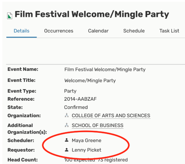
Image: Contact names appear in the details of objects throughout 25Live.