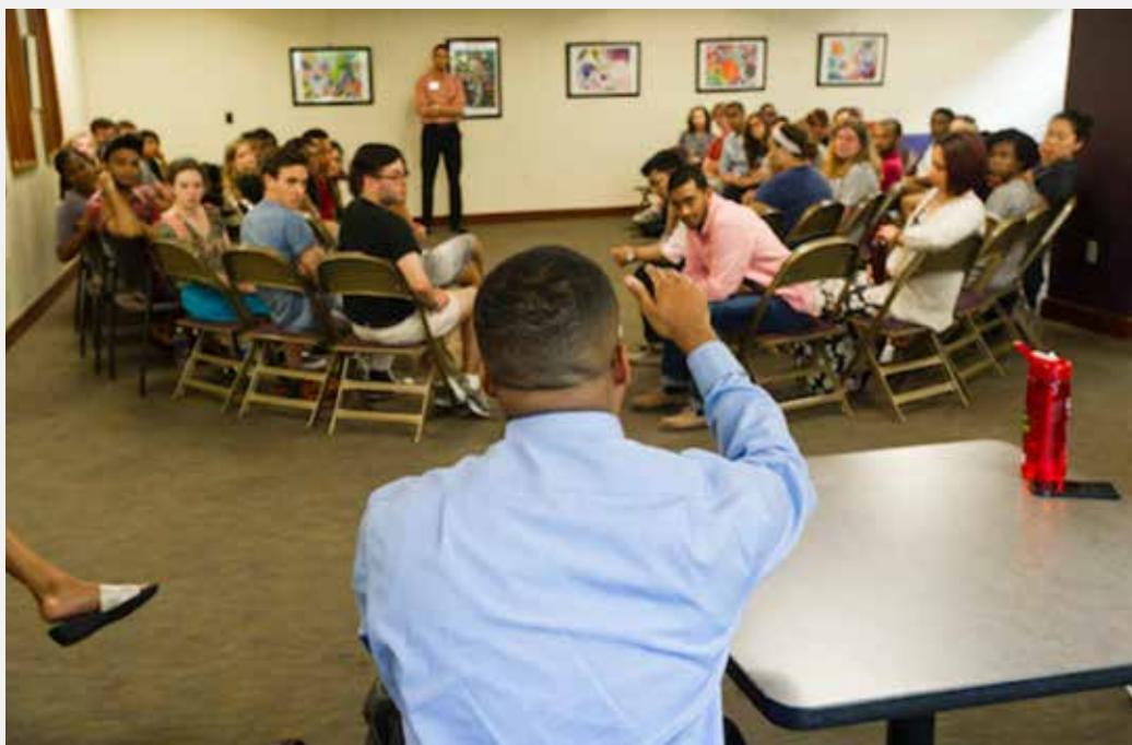
BU plans to expand the Howard Thurman Center for Common Ground, where students gather to discuss and bridge racial and other differences on campus.

Since its creation 30 years ago, BU's Howard Thurman Center for Common Ground has become a welcoming place for students to discuss racial and cultural divides on campus and to explore their shared humanity. The center's mission has become more important than ever in an era when racism—from police killings of young blacks to slurs and death threats at the University of Missouri—has sparked campus demonstrations across the country, including at BU.