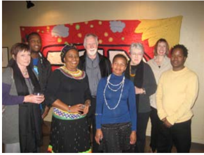
Participants at the opening reception of "South Africa: Artists, Prints, Community: 25 years at the Caversham Press"

Boston University Humanities Foundation supports a number of projects throughout the year. Here are some of this year's highlights: