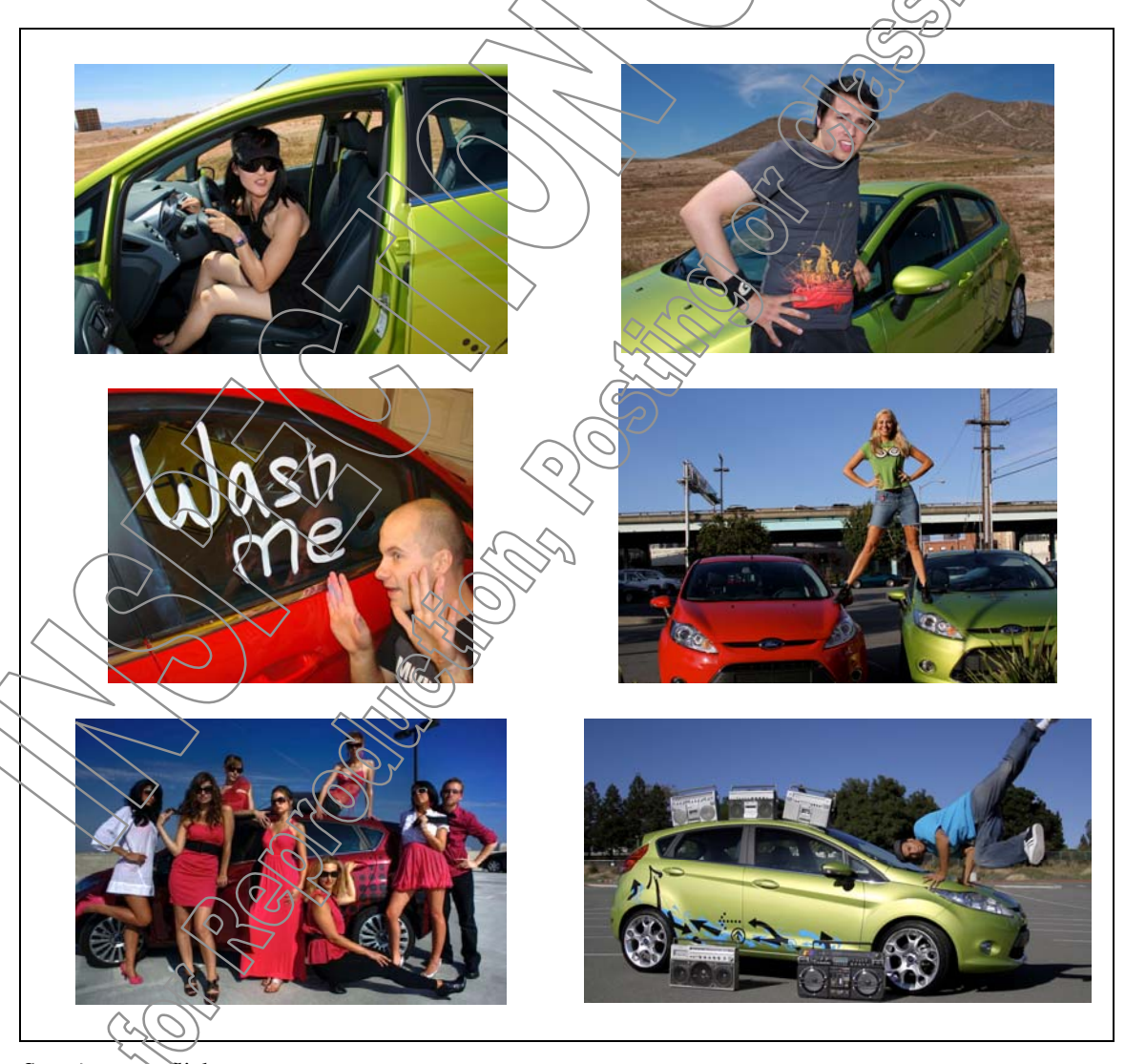
Exhibit 5 Examples of Photographs Posted on Flickr.com by Agents

content and to post it on social media websites. Agents had posted videos on YouTube, photographs on Flickr, and tweeted about the Fiesta on Twitter. Some also wrote blogs, and linked to their videos and photographs from their Facebook and MySpace profile pages. (Exhibit 5 shows examples of photographs that Agents posted on Flickr. Details about how much content was produced and how it was viewed are presented in Exhibit 6). Ford reported that approximately 50,000 consumers had expressed interest in buying a Fiesta once it was available, and that 97% of these leads did not own a Ford car.