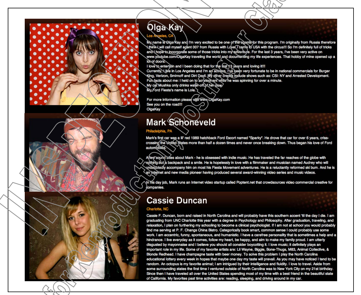
Exhibit 4 Examples of Ford Fiesta Movement Agent Profiles

The marketing team decided that short of getting to drive the car themselves, the best way for target consumers to learn about the car was from consumers who were similar to them. This is precisely what Ford did – they gave a new Fiesta (the 2009 European model) to a small number of very carefully selected Americans (individuals or couples) and let them drive it (for free) for six months. Over 4,100 people (or couples) applied to be "Agents of the Fiesta Movement" and just 100 were selected. Each Agent had a profile on the FFM website (www.fiestamovement.com: see Exhibit 4) and had to use social media (Twitter, Facebook, Flickr, and YouTube) to post about the Fiesta.