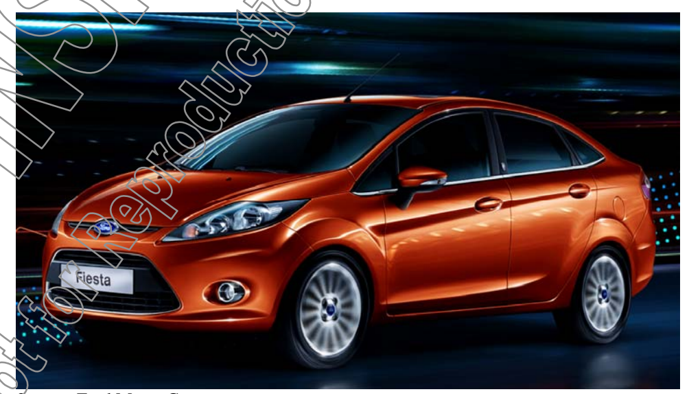
Exhibit 1 Ford Fiesta: 2009 European Model, Launched in October 2008

Times were changing and the American driver was developing a taste for smaller, affordable, and fuel efficient cars. The successes of the new Mini, the new Volkswagen Beetle, and the super-tiny Smart car in the US market in recent years suggested that the Fiesta might find a market in the country. In early 2009, Ford announced the return of the Fiesta to the American market with a fun, fuel-efficient, and sub-compact 2011 model, which was unveiled on December 2, 2009 at the Los Angeles Auto Show. This was based on the 2009 European model launched in October 2008 in Germany (see Exhibit 1).