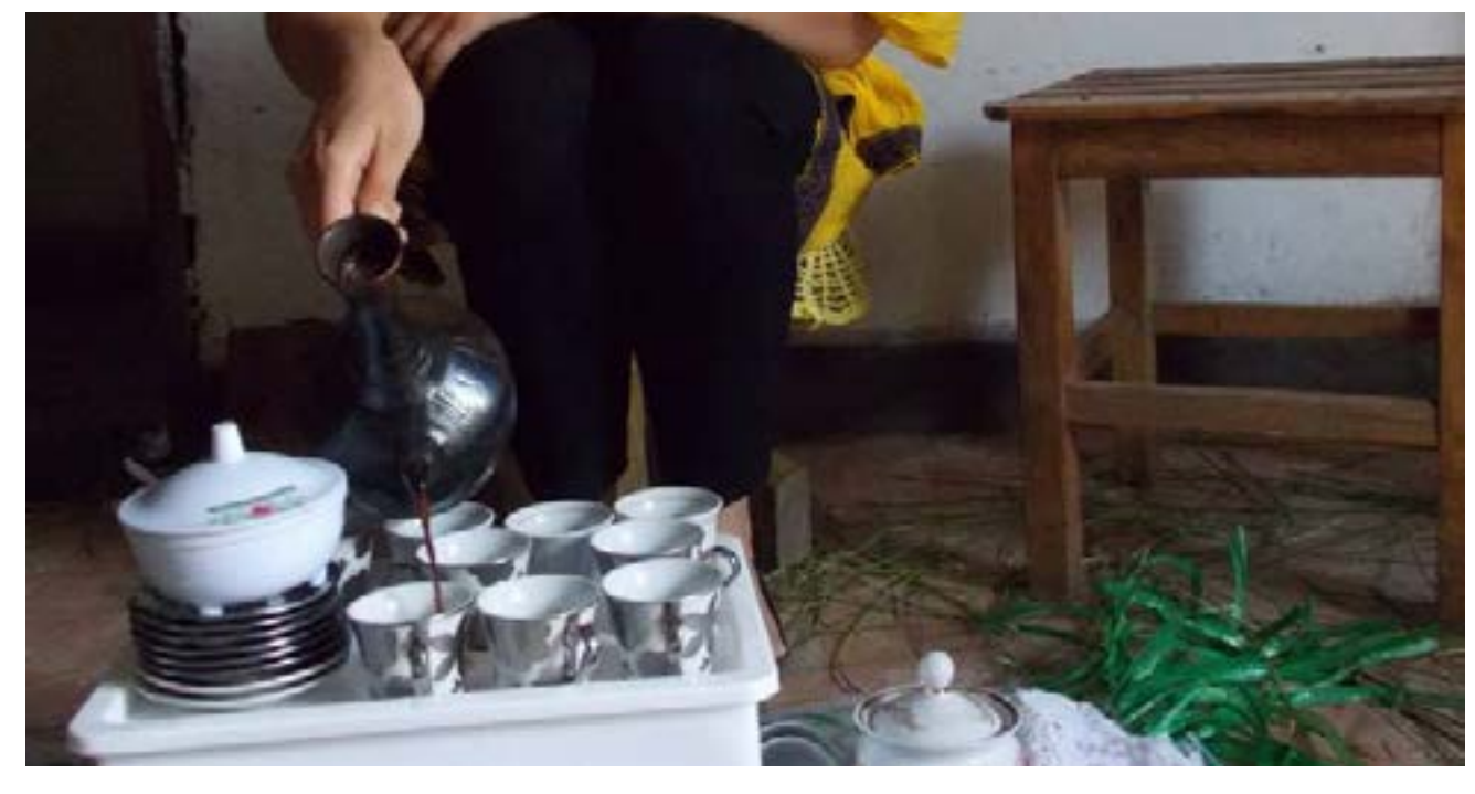
Serving bunna during Fasika