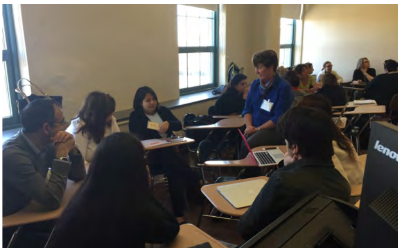
Faculty discuss flipped classroom approaches at the Spring 2015 Mini-Conference