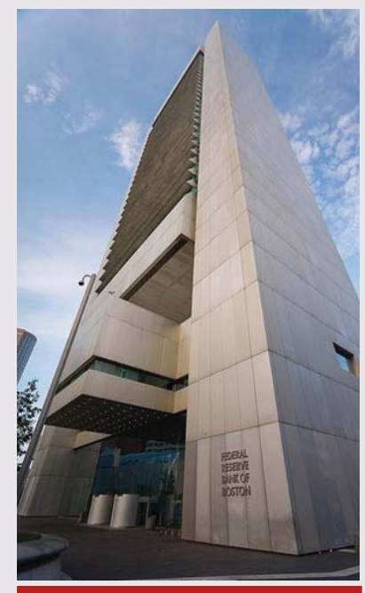
half of the team members The Federal Reserve Bank of Boston are returning next year, hosted the BU Economics Club for the team looks to build an informational tour and the Fed upon its experience and Challenge competition in which a improve its score this team of BU Economics students upcoming fall.

Although most teams create a mock Federal Open Market Committee meeting for their presentation, the BU team acted as external consultants hired to advise Fed economists. This approach allowed the team to make recommendations on more than just monetary policy. BU's Fed Challenge team members met multiple times a week in the months leading up to the competition; the team consulted faculty members and graduate students to refine the content of their presentation. As upcoming fall.