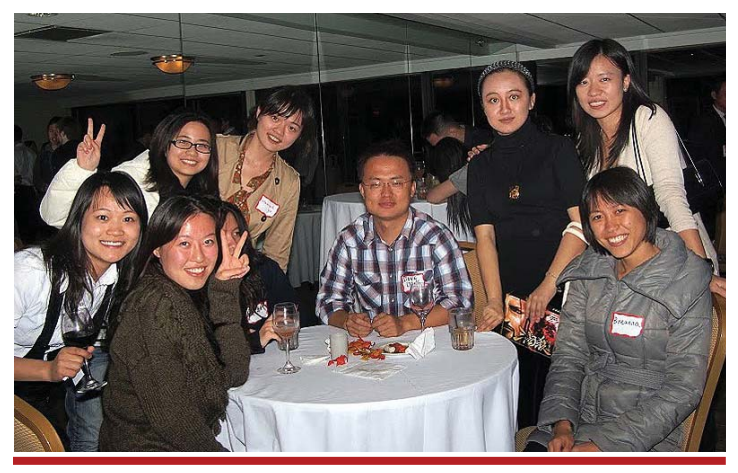
A merry crowd of MA students enjoy the fare at the Graduate Alumni Night held on October 29, 2010 at the Hyatt Hotel in Cambridge. Alumni, graduate students, and faculty mingled at this event.