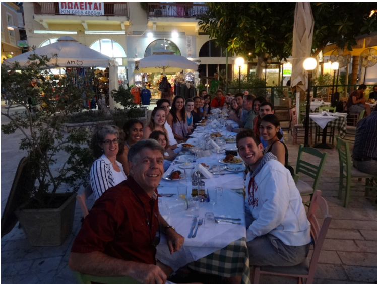
The 2014 Athens Summer Study group at dinner