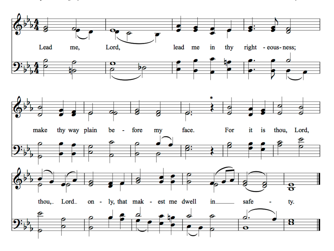
Prayers of the People