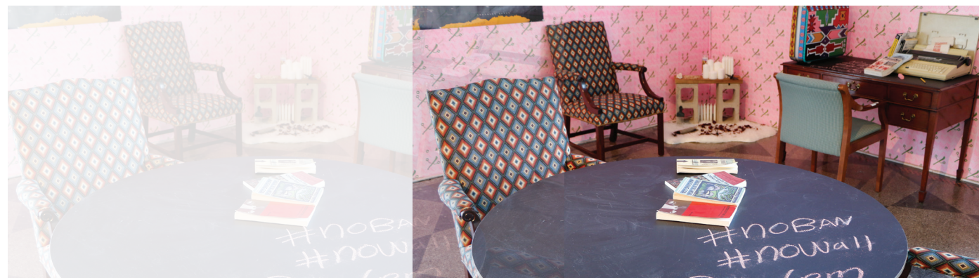
Intelligent Mischief Survival Agents Office (detail), 2017 Mixed media installation.