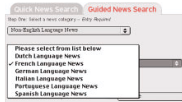
A foreign language news search.

Foreign language news Use the Guided News Search and choose the news category "Non-English Language News" and the language in the source list to search publications in that language. Your search terms need to be in that language.