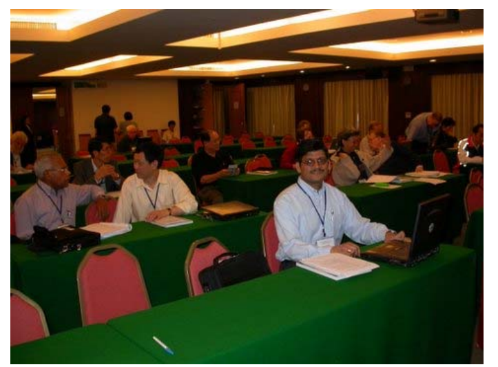
Discussions during coffee break at the CAWSES Workshop in Taipei, Taiwan, May 14, 2005

CAWSES mini-workshops on Theme 2 and Theme 3 science were held in conjunction with the International Symposium on Equatorial Aeronomy (ISEA-11) in Taipei. Taiwan in May 2005. These workshops focused on the results from the observations carried out during April-May, 2004 on the first joint CAWSES campaign on Space Weather and Coupling Processes in the Equatorial Atmosphere. It was encouraging to see that over 80 scientists participated, even though these workshops were held on the Saturday following a very full week of ISEA sessions. Several of those results are currently in the process of refereeing and they will be published in a special issue of Annales Geophysicae along with other papers presented during the ISEA-11 meeting. Several presentations related to Theme 1 and Theme 4 science were made during the workshops on Solar Variability and Planetary Climates in Bern. Switzerland in June and at the Solar Variability and Climate Workshop held later that month in Rome. The proceedings of these meetings will be published in two separate volumes. During the CEDAR meeting in Santa Fe, NM, USA in June 2005, D. Pallamraju made a presentation on CAWSES science and described how the science planning and its organization could help all the I*Y programs. In addition, many