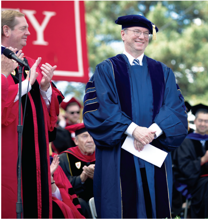
Eric E. Schmidt (Hon.'12) (left) urged graduates to turn off electronic devices for at least an hour a day. "Life is not about your friend count," he said. "It's about the friends you count on."