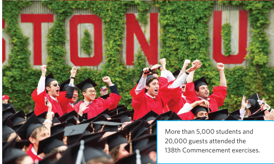
More than 5,000 students and 20,000 guests attended the 138th Commencement exercises.