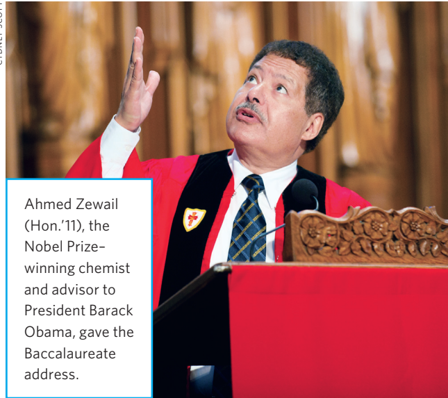
Ahmed Zewail (Hon.'11), the Nobel Prize-winning chemist and advisor to President Barack Obama, gave the Baccalaureate address.