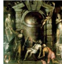
— fig. ⑤ —