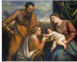
— fig. ③ —