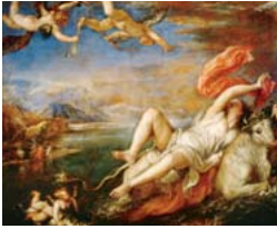
— fig. ② —