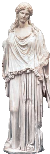
Eirene, loaned by the Italian government to the Museum of Fine Arts after the MFA returned antiquities to Italy.