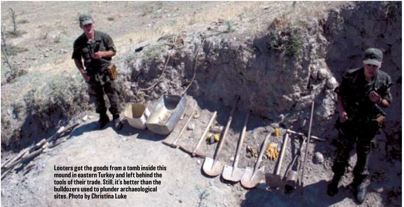
Looters got the goods from a tomb inside this mound in eastern Turkey and left behind the tools of their trade. Still, it's better than the bulldozers used to plunder archaeological sites.

track of antiquities — these are among the things we hope to learn,” she says.