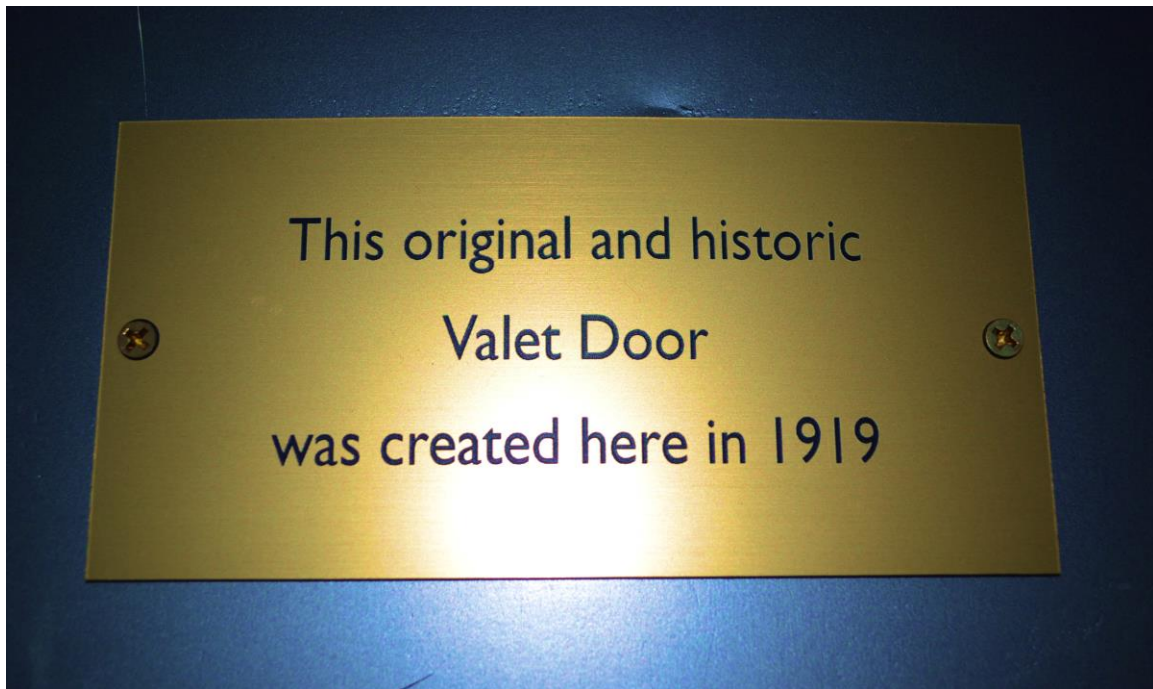
One of the few remaining Servidors in the Hotel Pennsylvania.

the United States where Servidors still exist is the Hotel Pennsylvania in New York City. However, the Servidors are no longer in use and have not been for decades. The doors have been sealed shut and are slowly being phased for modern wooden doors, eventually becoming a fragment of the hotel industry's past.