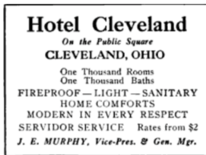
Hotel Cleveland advertising Servidor Service.

During the early 1900's, technological advances such as the electric fridge invented in 1910 and the creation of stainless steel in 1916 started to modernize the hospitality industry. In June 1918, the contraption known as the Servidor began emerging in hotels. The Hotel Fort Shelby of Detroit was the first hotel in the world that implemented Servidor service. (Ibbotson, p. 45). The Servidor transformed the way hotels provided guest services by offering guests the privacy of a real home.