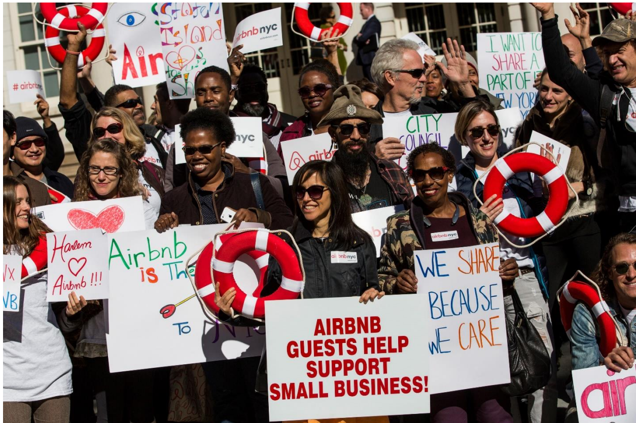
3 Airbnb is finding both opposition and support in cities all over the world. In October 2015, New York City residents showed support for Airbnb while the city council debated on how to regulate the company. The San Francisco Tourism Board recently partner

Business Travel Ready initiative that identifies specific listings with a Business Travel badge, indicating that the hosts are providing additional amenities suitable for business travelers. These amenities range from ironing boards to fire alarms and CO 2 detectors. The company also formed a partnership with a leading meeting planning management company, Experient, for adding Airbnb room blocks to official MICE event room inventory (Meetings, Incentives, Conferences, and Events), and providing metrics about booking patterns. There also seems to be an increasing “official” acceptance of the company: the San Francisco Tourism Board recently partnered with the company to provide neighborhood tourism materials for local businesses to help attract Airbnb guests. Such official recognition by Destination Marketing Organizations (DMO) is likely to further intensify the hotel industry’s efforts to impose regulations on the sharing economy.