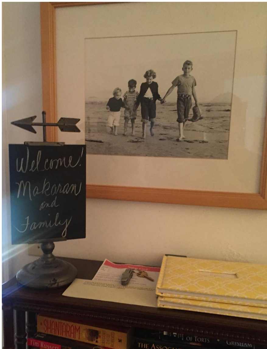
5 A simple welcome sign that makes all the difference in creating an authentic, memorable, hospitality experience.

hotel experiences, with local hosts at the very center of delivering hospitality in its most primal form - creating memorable experiences through good-old fashioned interpersonal contact. For example, an Airbnb host and his wife in San Francisco rent out the second floor of their two-storied house to families, and cook a delicious barbecue in the evening to welcome their weary travelers. My own recent experience in the town of San Luis Obispo in California attests to this dimension. The hosts, a retired couple who seemed truly delighted to have us in their home, did everything from talking all about their family and getting to know more about mine, to providing hotel-like toiletries in the bathroom, leaving croissants and fresh strawberries in the refrigerator, and, most memorably, placing a small welcome sign on a chalkboard on the dresser – a neat little touch. Interestingly, it appears that while the hotel industry, to a great extent, is placing technology-enabled convenience and entertainment at the center of its experience (digital keys, selecting your exact room prior to arrival via app, a robot that stores your luggage, Netflix on your guestroom TV, among others), the sharing economy is using technology to facilitate a simpler, more authentic, down-to-its-roots hospitality experience.