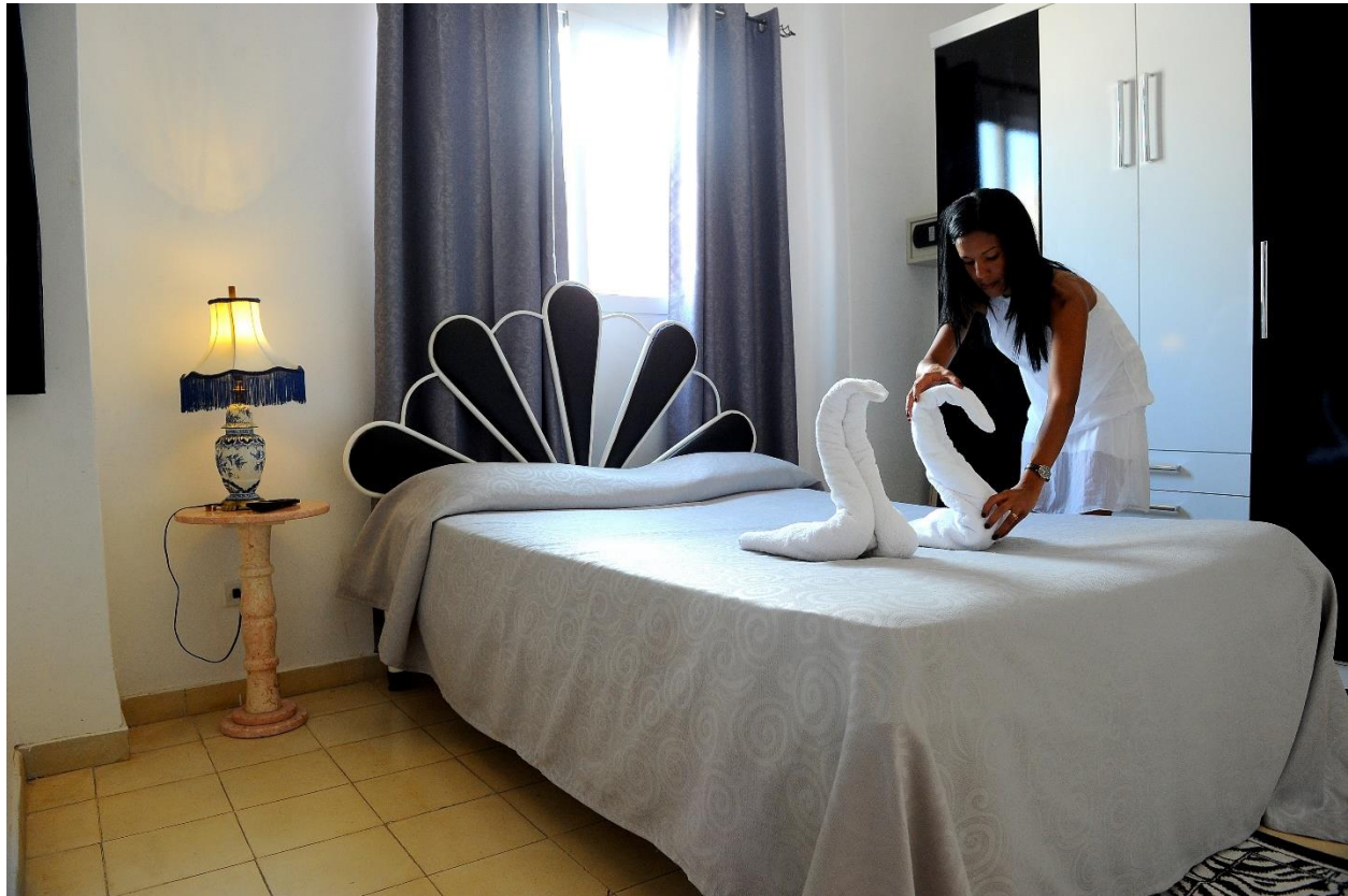
2 Consumers are getting more comfortable with the idea of becoming Airbnb hosts with their own properties. In Cuba, Airbnb has found booming success as locals become private entrepreneurs.

some markets. Such statistics have resulted in the hotel industry crying foul about not having a level playing field on various accounts, from occupancy taxes to sharing economy providers skirting health and safety standards. Cities and other jurisdictions across the country are engaged in their own efforts to regulate the sharing economy.