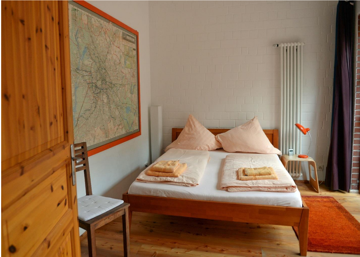
1 Airbnb's offer an at-home atmosphere and depending on the host, includes a variety of unique amenities at an affordable price.

No one can deny that the hotel industry has a fight on its hands when it comes to the peer-to-peer accommodation market. A recent PWC report showed that while 6% of the US population has participated in the sharing economy for the hospitality industry as a consumer; 1.4% has served as a provider. Following a series of acquisitions, Airbnb is the undoubtedly the hotel industry's biggest competitor. While much of the discussion that follows uses Airbnb as an example, the underlying logic applies to the broader concept of the sharing economy and its implications for the hotel industry.