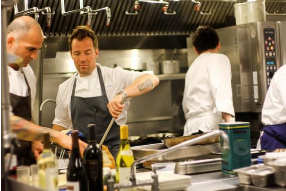
5 As consumers expect higher quality of service, restaurants can be more selective in their hiring and build innovative business models.

creative ways to cut costs and increase the service value. And while the tradition of food service may not change within the next decade or so, it is clear that new models of employment are beginning to have a presence in the industry.