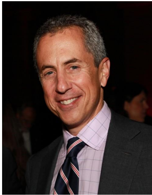
4 Danny Meyer, CEO of Union Square Hospitality Group is causing a shift in the restaurant industry by doing away with tipping in return for higher salaries.

4.2% in the fine-dining industry in the past year, supporting skilled workers has become vitally important as restaurants compete to become the best of their markets.