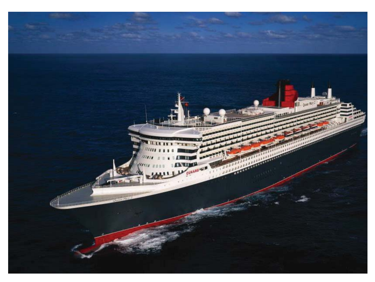
Left, Queen Mary 2 (2014)

niversaries has been renewed this year, with Cunard taking full advantage of its history for marketing purposes. The current website and recent paper brochures make prominent mention of the 175th anniversary, feature a special '175' logo and a painting of the original flagship Britannia , and offer several anniversary events to prospective customers.