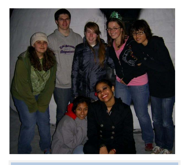
Undergraduate Students in the Boston University Astronomical Society, BUAS, posing in front of the Coit Observatory on the roof of CAS.

approximately 75% (361) were CAS students and 25% (120) were students from other schools and colleges.