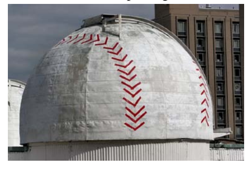
The observatory dome disguised as a baseball for the Red Sox Opening Day.

behind the new drywall are corroded, and the exterior walls are rusted and peeling.