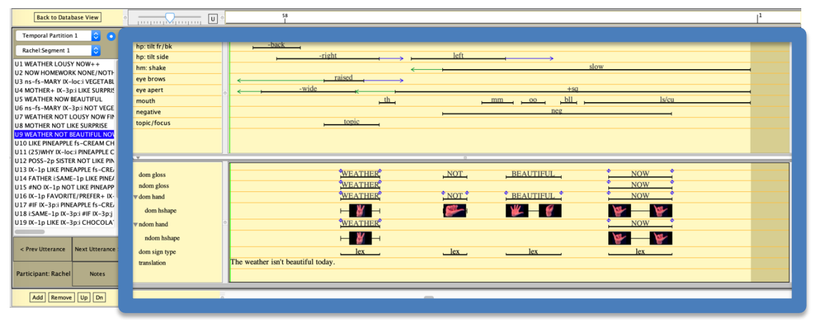
Figure 3. To use arrow keys for navigation in Utterance Index on the left of the Utterance Window: click first within the rectangle shown.

In addition, in Utterance view, double-clicking on a nonmanual field label temporarily triggers the up/down arrow keys to move the highlighted nonmanual field label instead of moving to the previous/next utterance.