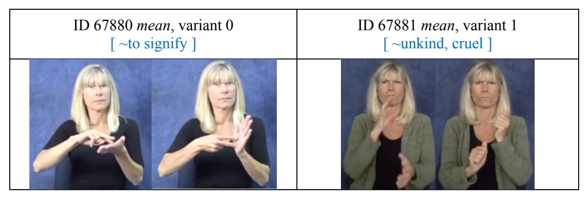
Figure 3. Supposed Dialectal Variants in WLASL

The issues exemplified above are pervasive in the WLASL data, posing critical obstacles to using this dataset reliably for computational research, despite the fact that it has been widely used for such research; a partial list of research based on these data can be found at: https://paperswithcode.com/dataset/wlasl. This surely explains, at least in part, the low recognition rates that have been reported (e.g., less than 63% for top-10 accuracy on 2,000 words/glosses [2]).