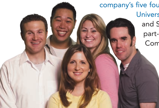
The minds behind Embryo Creative.