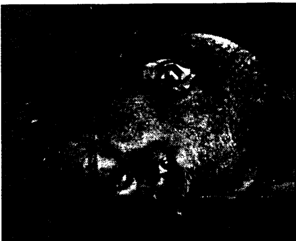
APARC president-in-residence and former Zambian president Kenneth Kaunda.

will continue to assist both the center and Africa itself.