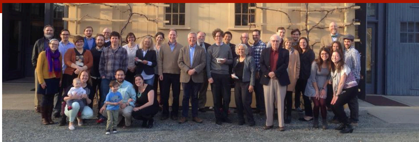
End-of-the-year party at Longfellow House - Washington's Headquarters, Cambridge, MA