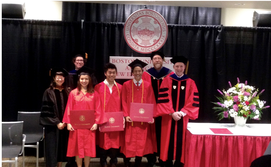
May 2016 graduates