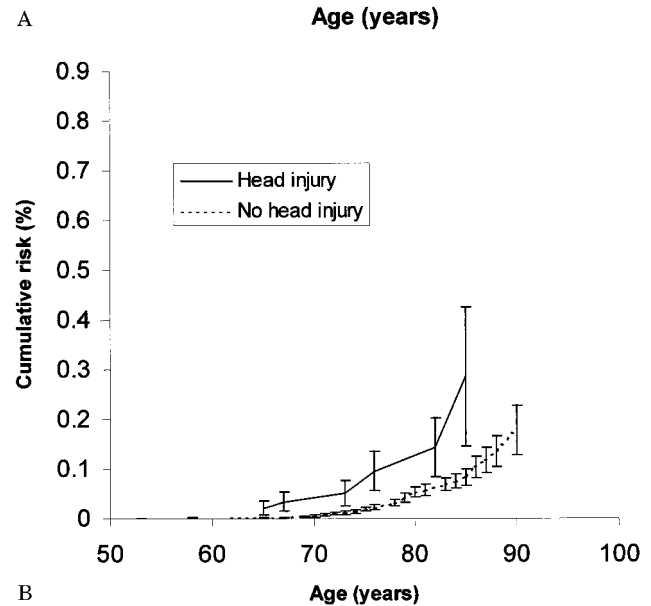
Figure. (A) The cumulative risk of AD in relation to head injury among parents and siblings of patients with AD. Vertical lines represent the 95% confidence limits for the point estimates. (B) The cumulative risk of AD in relation to head injury among spouses of patients with AD. Vertical lines represent the 95% confidence limits for the point estimates.

odds ratios within subjects with and without head injury clearly showed the dose-dependent effect of the \epsilon 4 allele on the risk of AD among those without head injury (table 5). Although the effect appears stronger for those without than for those with head injury, these differences were not statistically significant on either an additive or multiplicative scale. Viewed in another way, head injury increased the odds of AD to a greater extent among those lacking \epsilon 4 (OR = 3.3 [3.3/1.0]) than among \epsilon 4 homozygotes (OR = 1.3 [10.3/7.9]) or \epsilon 4 heterozygotes (OR = 1.8 [5.7/3.1]). Analyses that classified head injury with no loss of consciousness as negative for head injury showed a pattern of results similar to table 4 (data not shown).