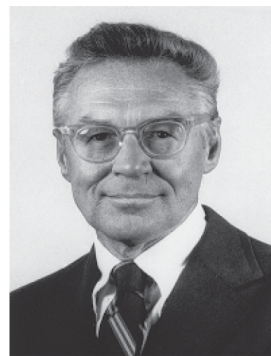
Albert L. Lehninger, 1917–1986